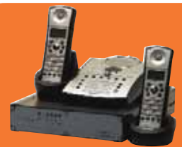
Satellite Modem RST200^