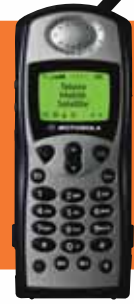
Motorola 9505A Handset

For more information about Telstra Mobile Satellite call 1800 632 995 or go to www.telstra.com/countrywide/mobilesat